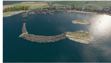
Rock Breakwater and Revetment Locations