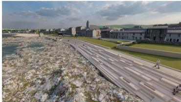
Precast Walls and Stepped Revetments