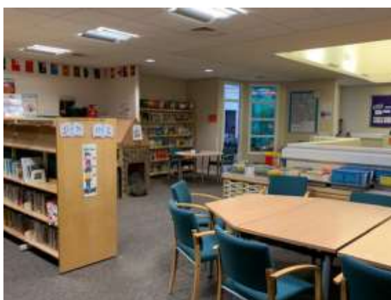
Our Library and ICT Suite