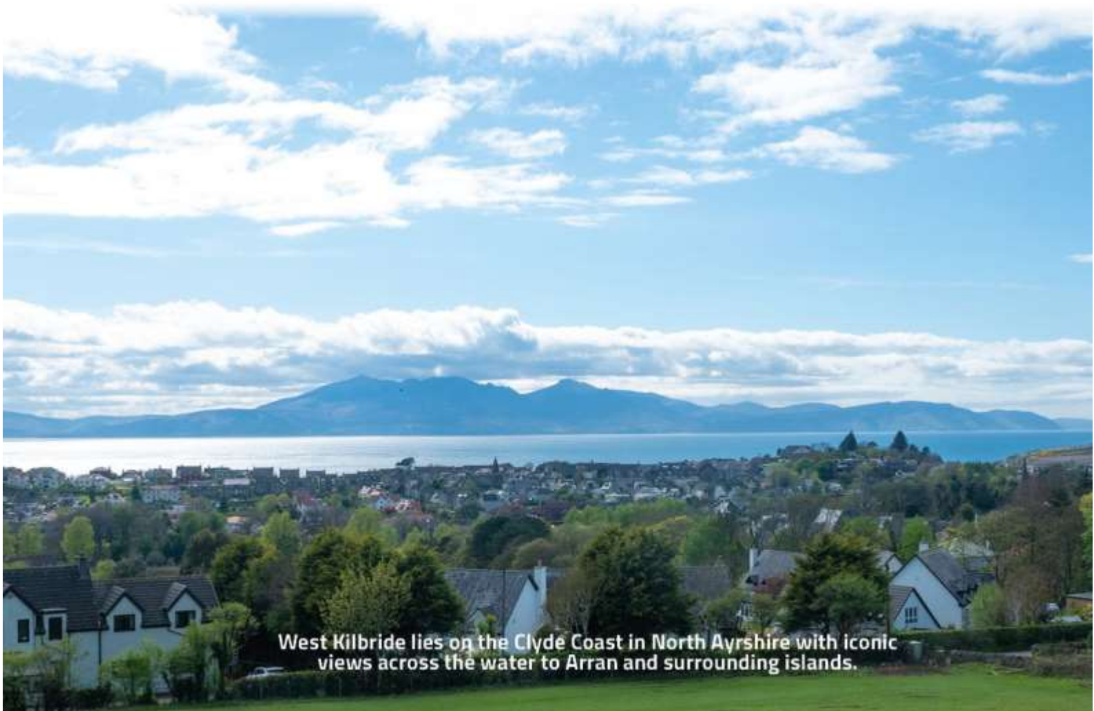
West Kilbride lies on the Clyde Coast in North Ayrshire with iconic views across the water to Arran and surrounding islands.