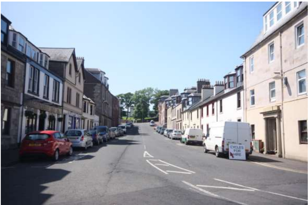
Figure 3-2: Cardiff Street July 2013, PDA