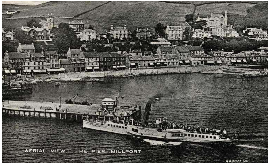
Figure 2-3: Postcard View, Circa 1921 (SCRAN)