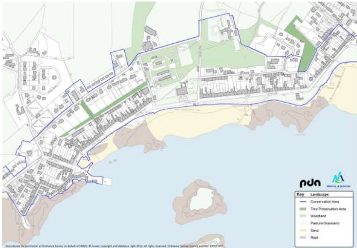
Figure 4-2: Millport Conservation Area Analysis - Landscape. See Appendix One