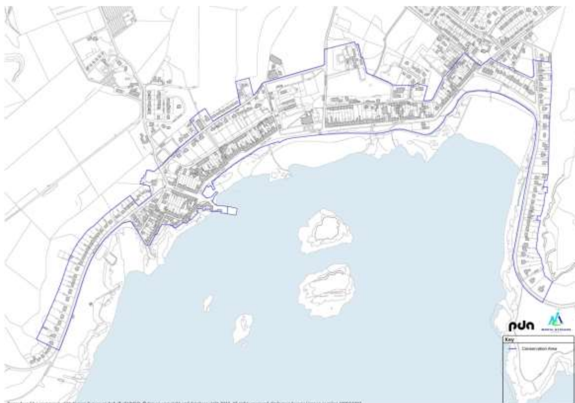
Figure 1-2: Millport Conservation Area.