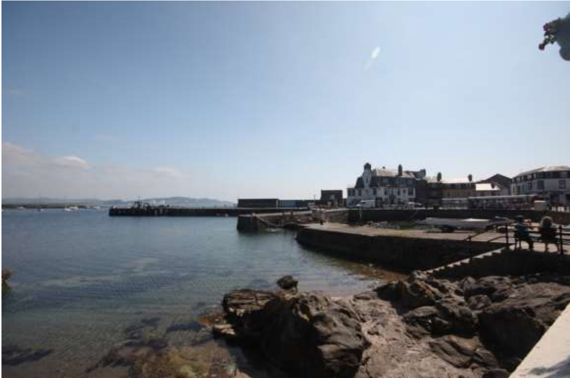
Figure 3-4: Millport Old Harbour, Quayhead and Old Pier, July 2013, PDA