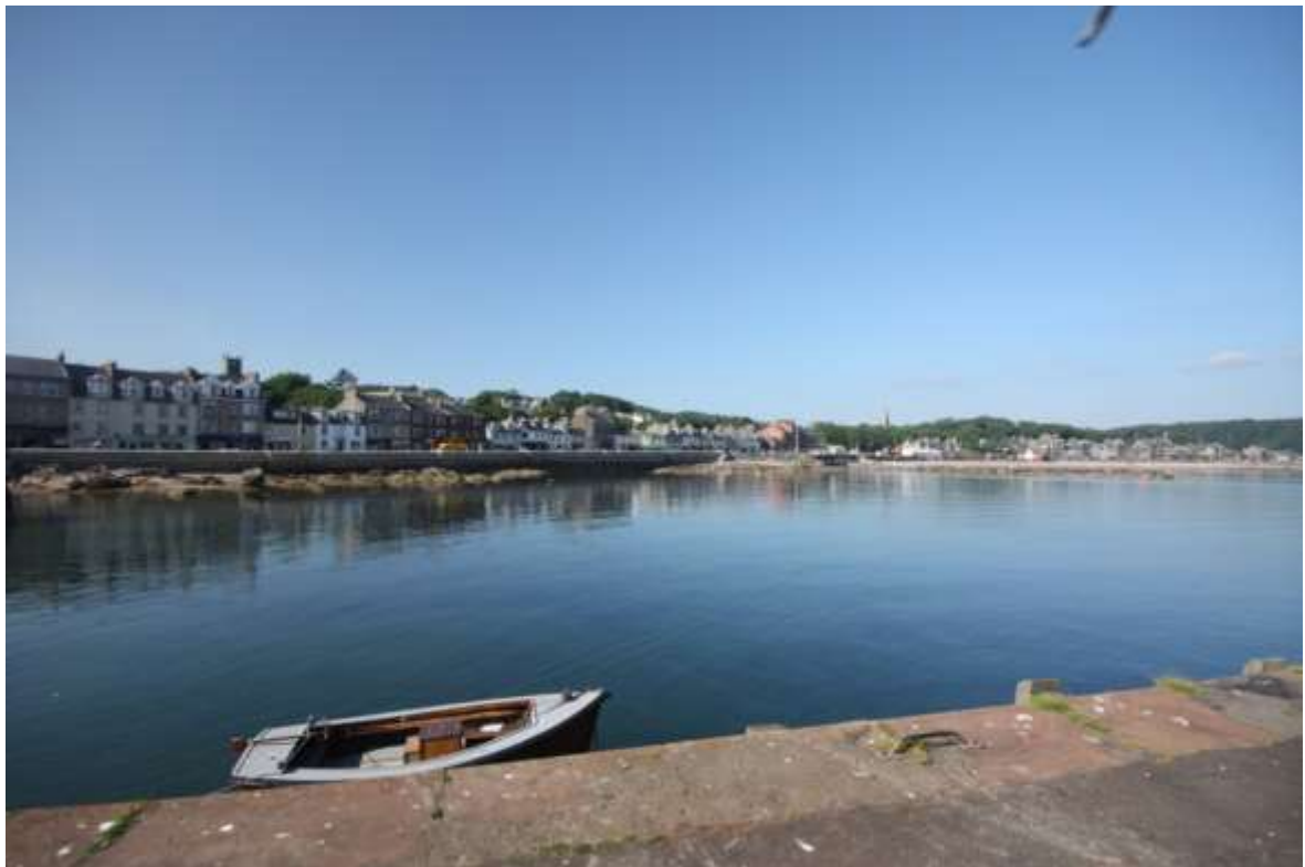
Figure 1-1: Millport waterfront, July 2013 (Peter Drummond Architects)