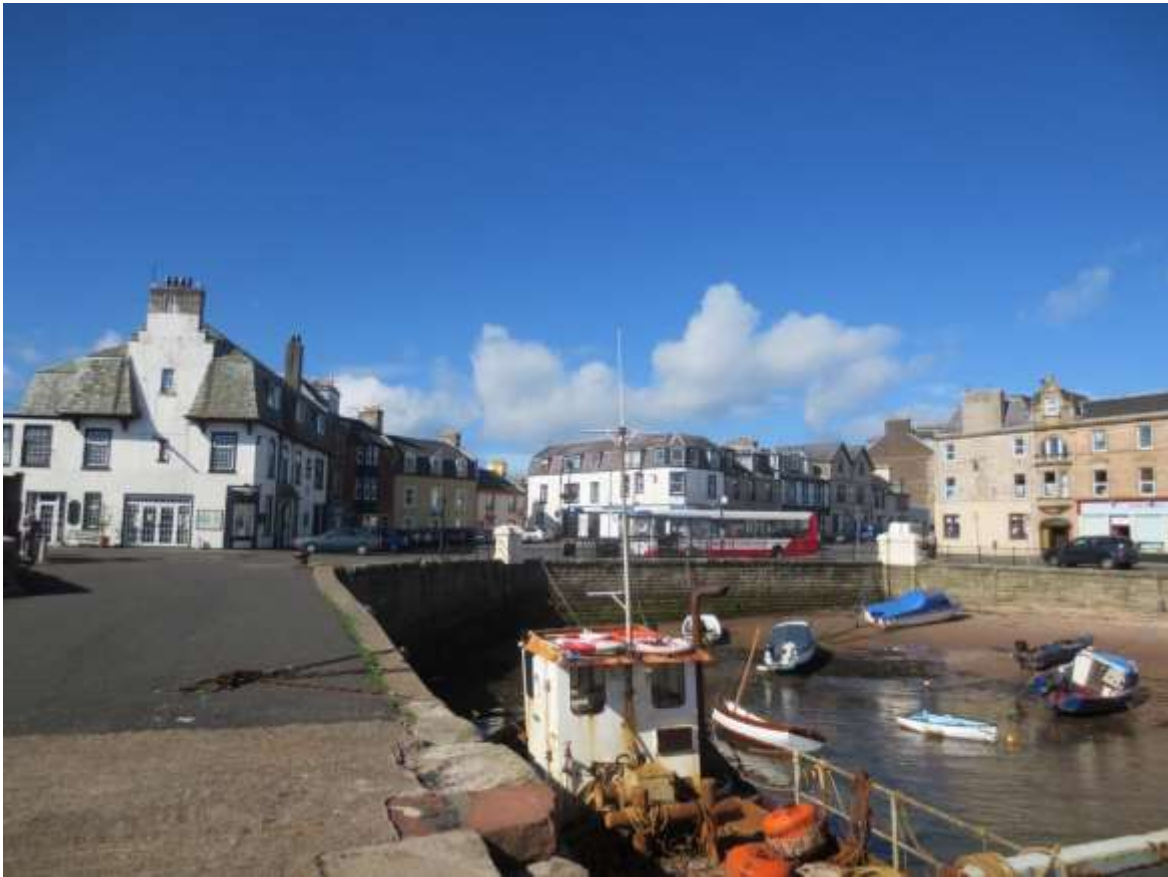
Figure 2-1: Millport Quayhead, July 2013 (Ironsides Farrar)