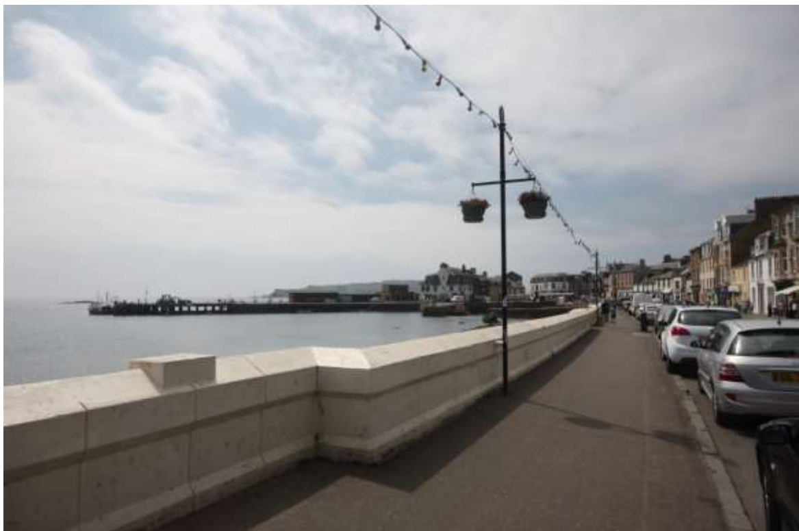
Figure 4-6: Stuart Street and Sea Wall July 2013, PDA