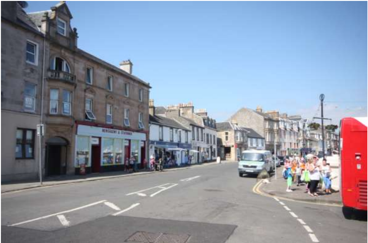
Figure 4-3: Millport Stuart Street July 2013, PDA