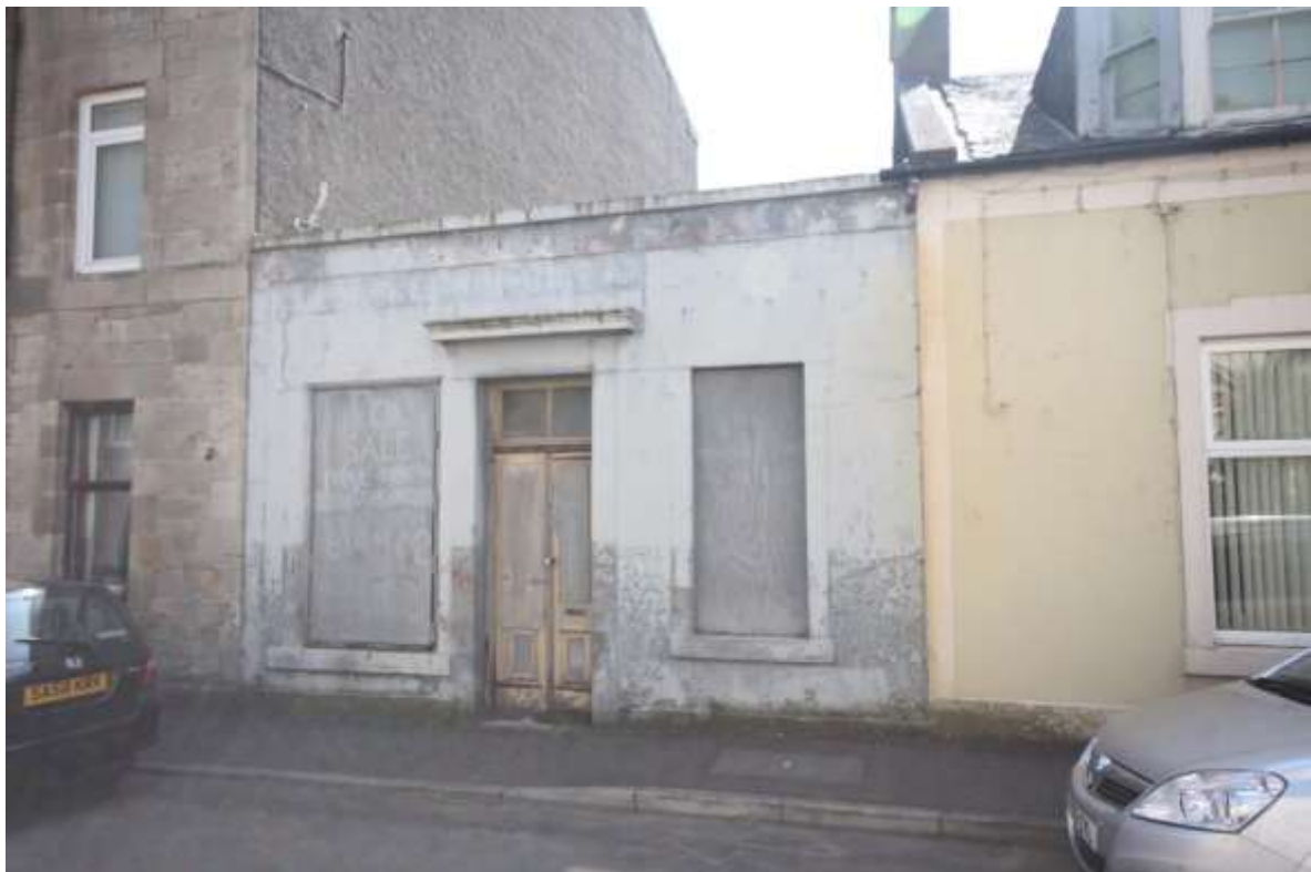
Figure 4-7: 7 Miller Street July 2013, PDA

Asphalt – all the roads in the conservation area have been asphalted during the course of the latter half of the 20th century. This, combined with road markings, has had a profound impact on the appearance of the conservation area. Formerly the conservation area would have been dominated by a mix of compacted dirt or tarmac roads with a verge of whin setts – many of which can still be seen at the edges of asphalt roads in the original settlement.