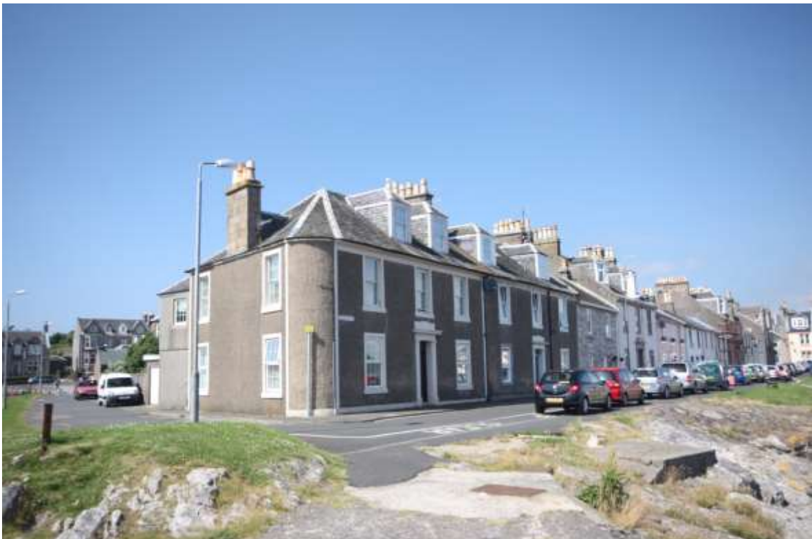
Figure 4-5: Georgian Terrace 12- 28 Crichton Street July 2013, PDA