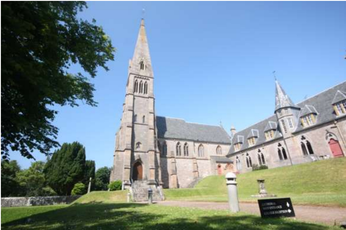
Figure 3-3: Cathedral of the Isles July 2013, PDA