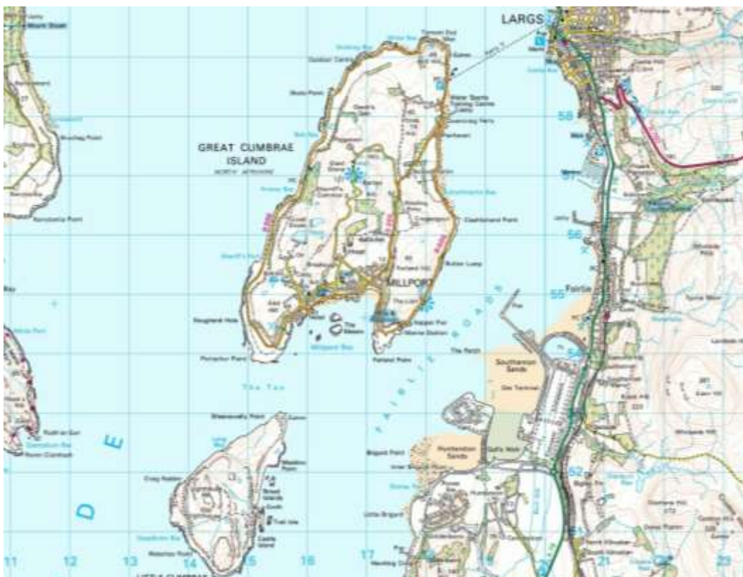
Figure 2-2: Location Plan.

As with much of the adjacent Ayrshire coastline, Cumbrae has fine examples of raised beaches. These occur perhaps most notably in the area surrounding Bell Bay - where the island's highest waterfall, Horse Falls, plunges over the old sea cliffs.