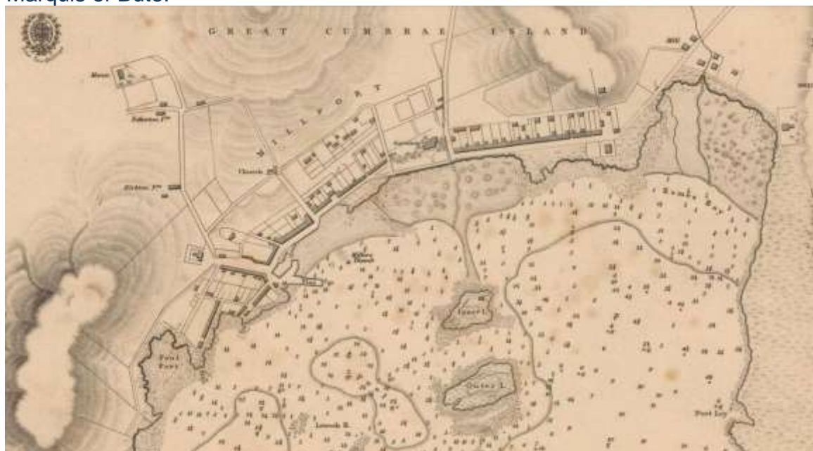
Figure 3-1: Captain Robinson's sketch of Millport 1845