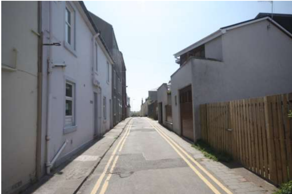
Figure 4-1: Clyde Street July 2013, PDA