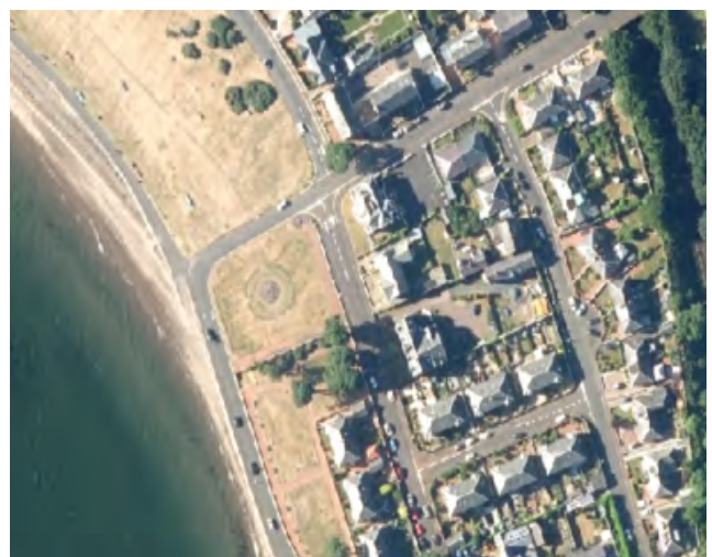
Figure 8. Aerial view of the foot of May Street. The area with the circular imprint could be zoned for parking.