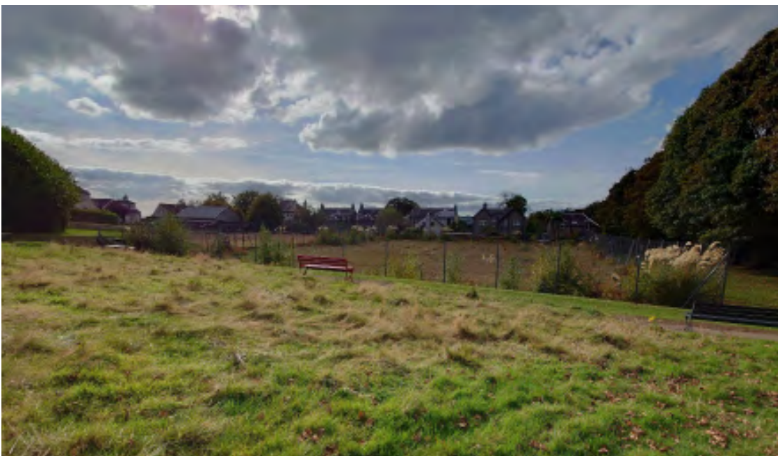
Figure 12. Dilapidated Douglas Park Tennis Courts awaiting Community Asset Transfer.

In the future there may be a requirement to create facilities such as toilets or changing areas, or storage buildings.