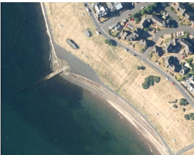
Figure 13. Aerial view of Cairnies Quay and adjacent Prom and toilet facilities.

The Local Development Plan 3 should be cognisant of future aspirations to bring Cairnies Quay into more regular use. Whilst the area is designated open Space currently, should plans come forward to develop facilities in this area, the plan should acknowledge this and ensure that well thought out, beneficial developments specific to Cairnies Quay would accord with the development principles.