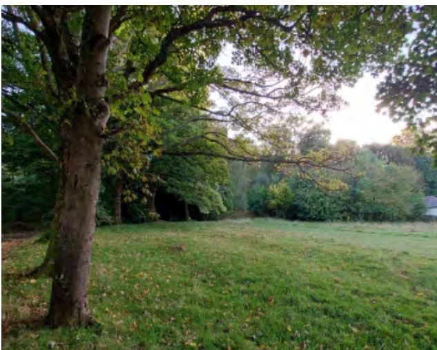
Figure 3. Space at Douglas Park for landing area for future ski slope or alpine roller coaster.

We want it to bring local employment opportunities and direct income to the local economy while profits can be used to help pay for vital council services.