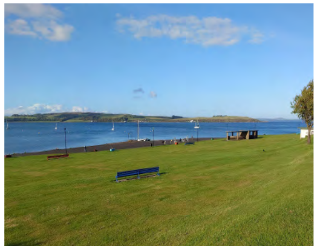
Figure 14. Cairnies Quay and surrounding area.