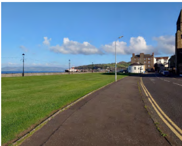
Figure 5. Land opposite St Johns Church, Bath Street could be used for parking provision.

During Peak seasons, parking for visitors has very difficult, with limited spillover options available, other than street parking in the streets behind the Prom. During the Viking Festival 2024 this caused many issues with narrow streets becoming blocked, however there was no alternative to try alleviate the overspill.