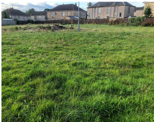
Holehouse Road site.

The Green Futures Group has engaged with residents in the surrounding area and received overwhelmingly positive support for the project.