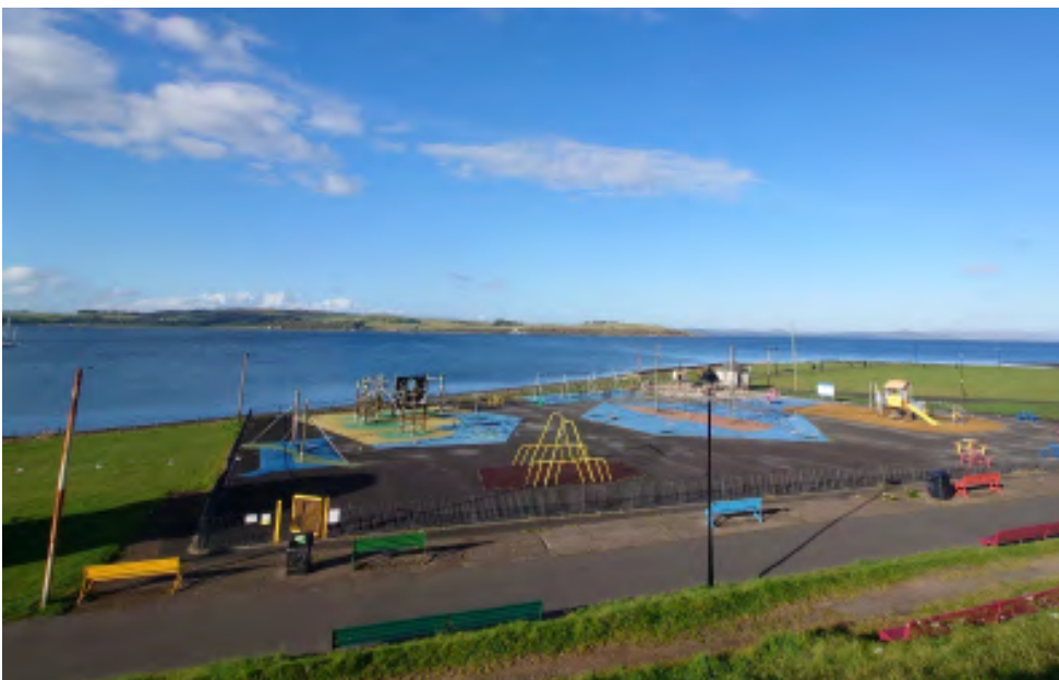
Figure 16. Dilapidated playpark at Mackerston.

Local feedback from residents and young people is that the facilities are basic and need to be better.