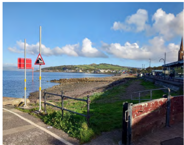
Figure 6. Land adjacent to the Cumbrae Slip in Largs could be used to create dedicated parking for ferry users, reducing pressure on the sea front car park and encouraging more foot travel to Cumbrae.