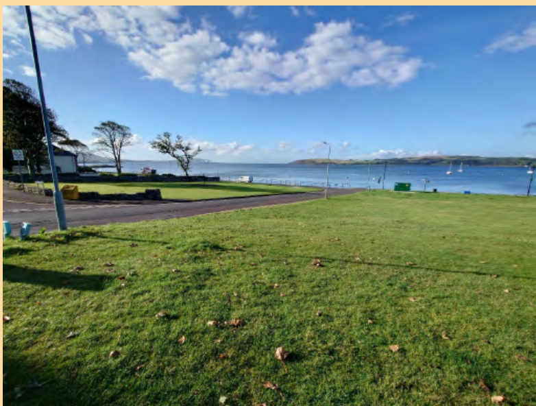
Figure 4. Open space at foot of May Street which could be used for parking provision

It is very clear that the community supports a scheme to provide a scheme to allow Park and Ride or Walk.