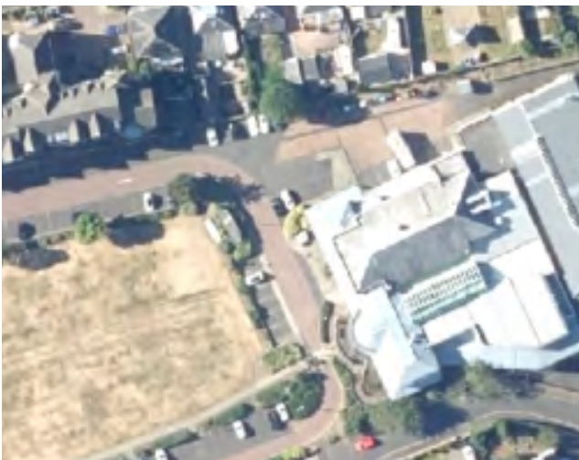
Figure 9. Aerial view, Vikingar Leisure Centre, arial view.

Engagement with Community Groups shows that whilst there is various provision of halls and rooms, there is a lack of a real community hub with dedicated facilities, whether meeting rooms, AV equipment, Changing Spaces or disabled access.