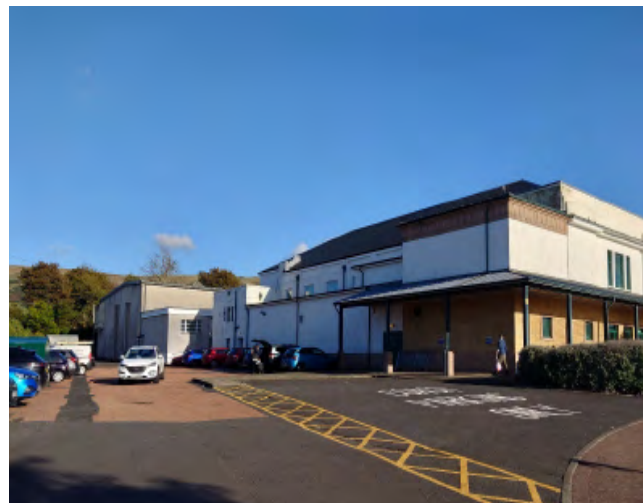
Figure 10. Space at side of Vikingar building which offers potential for expansion.