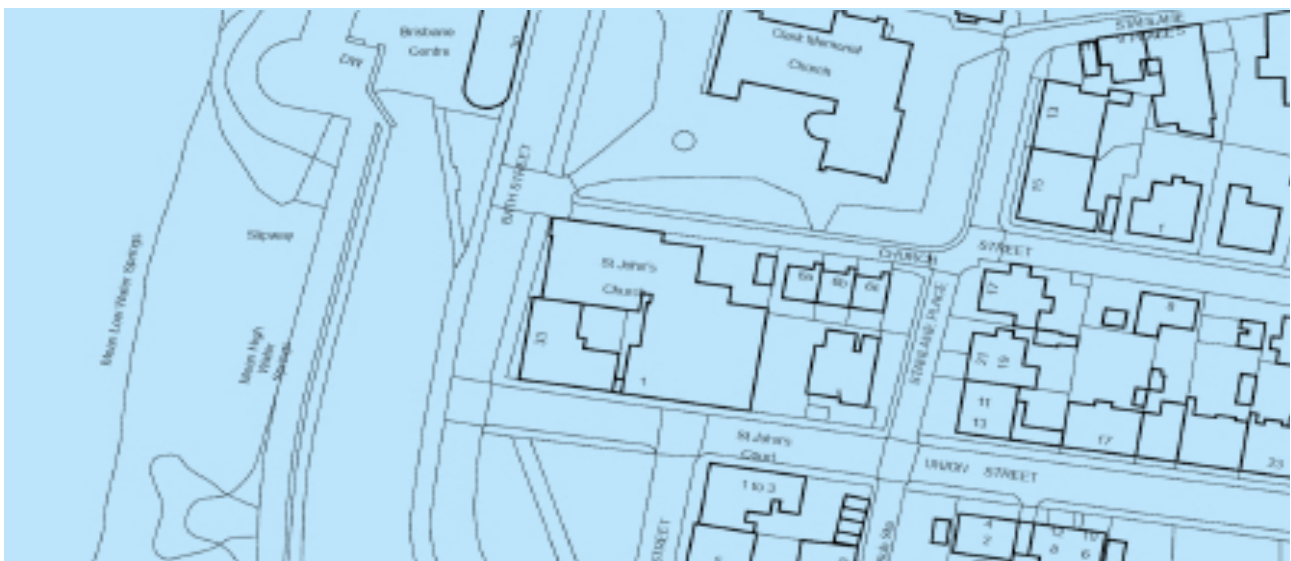
Figure 11. Map view of St. John's Church, Bath Street.

Unlike the majority of major towns in North Ayrshire, Largs has not dedicated Community Hub and has to ‘make do’ with various disparate properties.