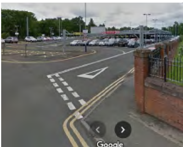
Figure 7. Low level multi storey car park at Johnstone, Renfrewshire as an example of an option for Largs.

Specific ideas and suggestions for location for new or additional parking are as below.