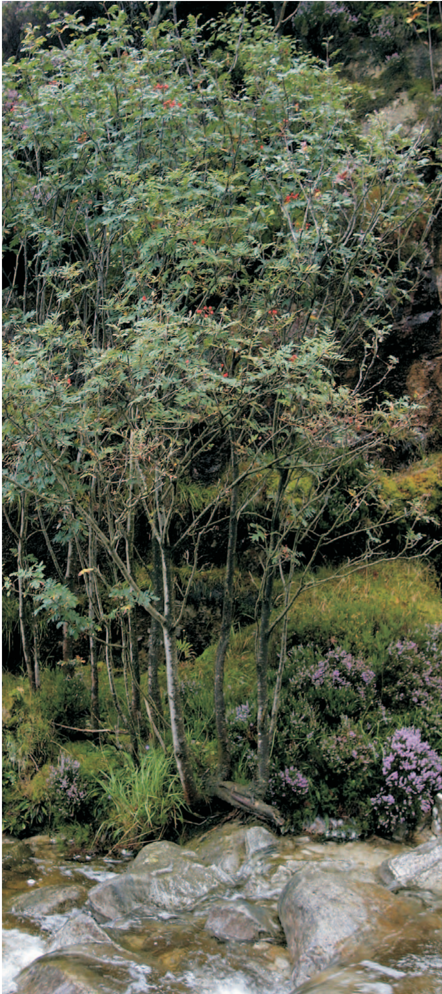
Sorbus pseudofennica.