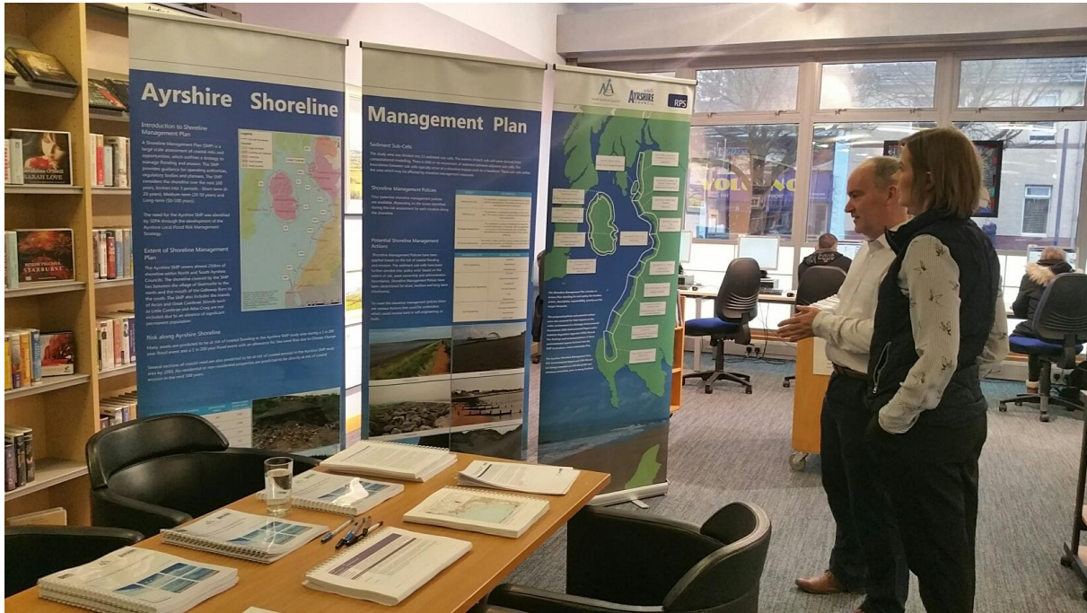
Figure 2.3 Irvine Library PCD – Photo 2