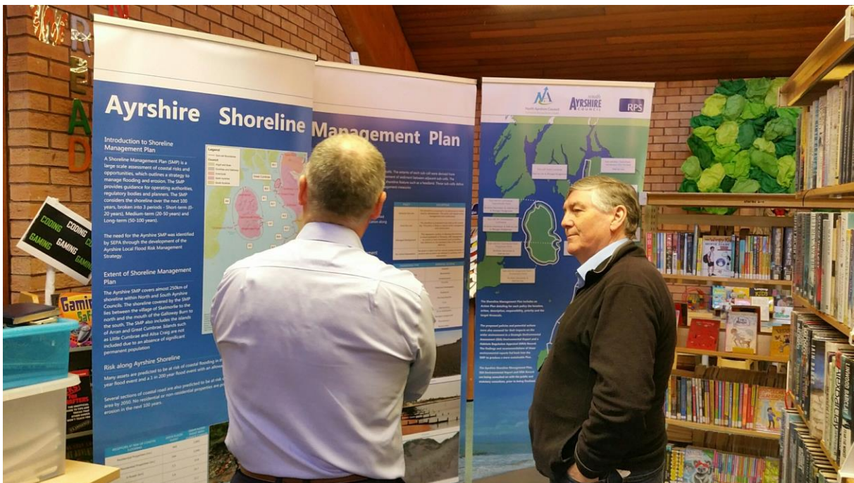
Figure 2.6 Largs Library PCD – Photo 1