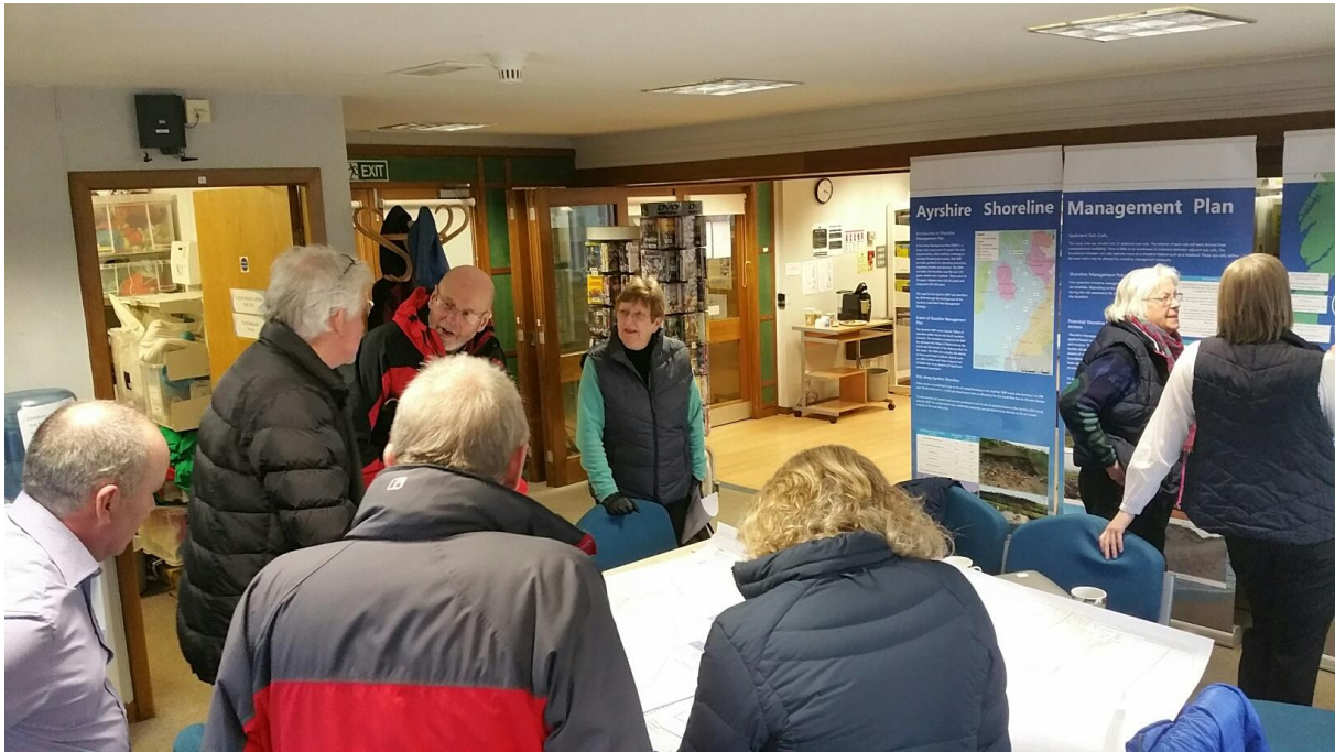
Figure 2.5 Arran Library PCD – Photo 2