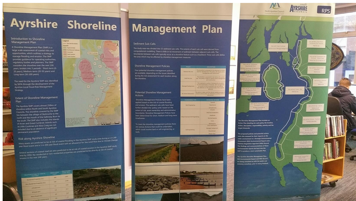
Figure 2.2 Irvine Library PCD – Photo 1

Staff members from North Ayrshire Council, South Ayrshire Council and RPS were on hand to meet and discuss the draft SMP and environmental assessments with the public and local stakeholders at each event. Rolling presentations, maps of the sub-cells and policy units, and banners describing the draft SMP were all provided at each PCD. All comments received were recorded by the consultation team to provide feedback to and influence the SMP. Photographs from a number of the PCDs are shown in Figure 2.2 to Figure 2.6 . A summary of the public and statutory submissions received during this 12-week consultation period, how the responses were actioned or how they will be taken into consideration in the future, is provided in Appendix A .