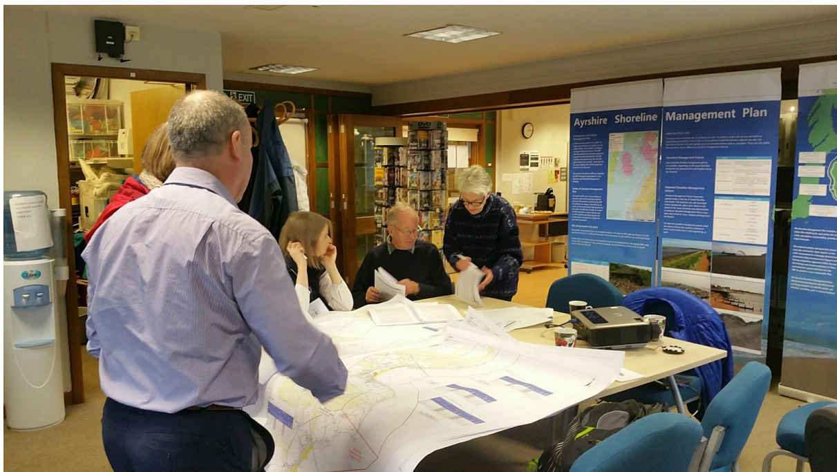
Figure 2.4 Arran Library PCD – Photo 1