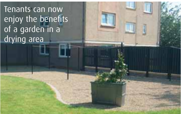
Tenants can now enjoy the benefits of a garden in a drying area