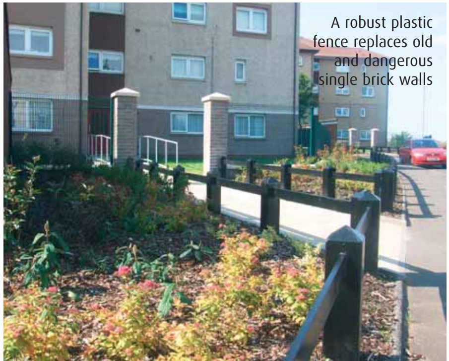
A robust plastic fence replaces old and dangerous single brick walls